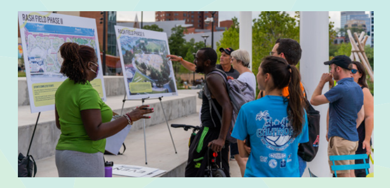
PHASE I - COMPLETED & OPEN FOR PLAY! PHASE I - A PARK IN PROGRESS THE LAWN THE LAWN THE LAWN THE LAWN THE GARDENS THE GARDENS

Phase 2 of Rash Field Park will take several more years to complete. Based on several months of community engagement and follow-up conversations facilitated by Assedo Consulting after Phase I's completion, the concept shown here was developed to consider places for recreation and leisure with a large open lawn, extensive gardens, a beach, and several walking paths, including a leisure walk, a nature walk which winds through the gardens, and a fitness trail that borders the beach, terrace and lawn.